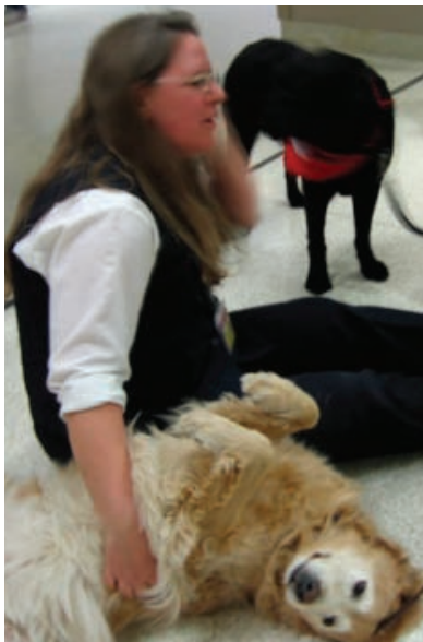
Callie (gold) and Emmet (black) convinced a staffer to get on the floor with them.

Volunteer Services at the University of Michigan Hospital celebrated "Therapaws Awareness Day" on Tuesday, May 6th, at Towsley Triangle. Ten different Therapaws teams came and went throughout the day (9 a.m. to 3 p.m.), charming, patients and staff alike. With the sale of Therapaws stuffed puppies and coffee mugs, and many donations, Therapaws received $357 to help further its programs. (Lots of exposure: Priceless.)