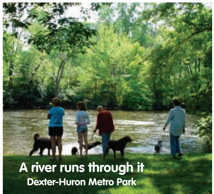
A river runs through it Dexter-Huron Metro Park