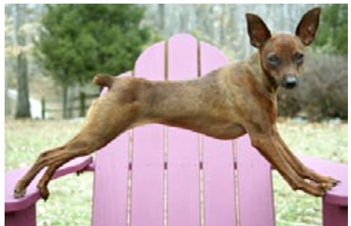
BELOW: Another of her clicker-trained dogs poses for the cameras.