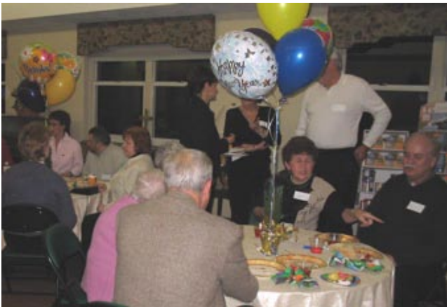
Spouses were included in the festivities, but our pet partners were not.